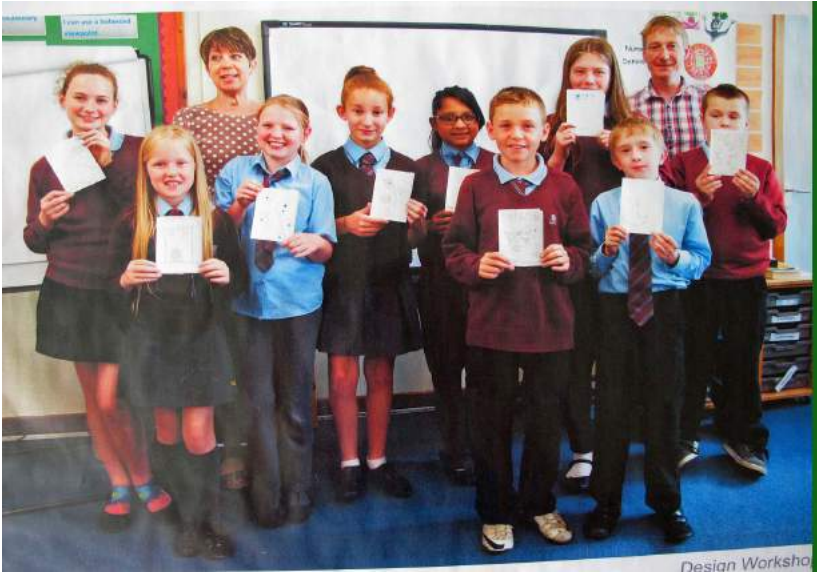
Alvey School children with their designs for the When in Sleaford plaques.