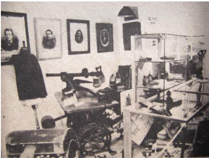
A new room of the museum. The year before, 1,000 people from Sweden, Canada, New Zealand, Australia, Holland, Jersey, Guernsey, the US, and Scotland came to the museum.